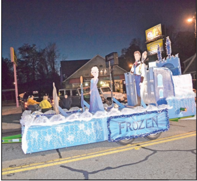
This "Frozen" float from National Title Pawn won First Place in the 2016 Sheriff's Christmas Parade. 2nd Place: SERVPRO, 3rd Place: Towns County Lions Club.