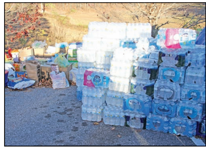
Towns County Fire is thankful for donations during the wildfire epidemic.

With the help of the U.S. Forest Service, the fires have become contained and more manageable, though they are now spreading even further into the North Carolina Nantahala Wilderness, with tough terrain that can make